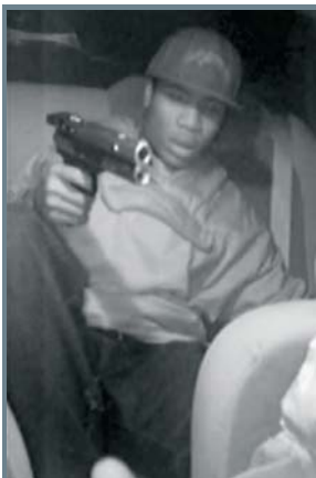
Sample image of a Toronto robbery taken from a dual camera

Controller: 6.4" x 4.0" x 1.4" Secure Memory Module: 7.5" x 5.5" x 2.0" G4 Single Camera: 2.75"(w) x 1.50"(h) x 2.40"(d) G4 Dual Camera: 4.50"(w) x 1.70"(h) x 3.25"(d) G4 Ball Camera: 2.40"(w) x 2.40"(h) x 2.50"(d)